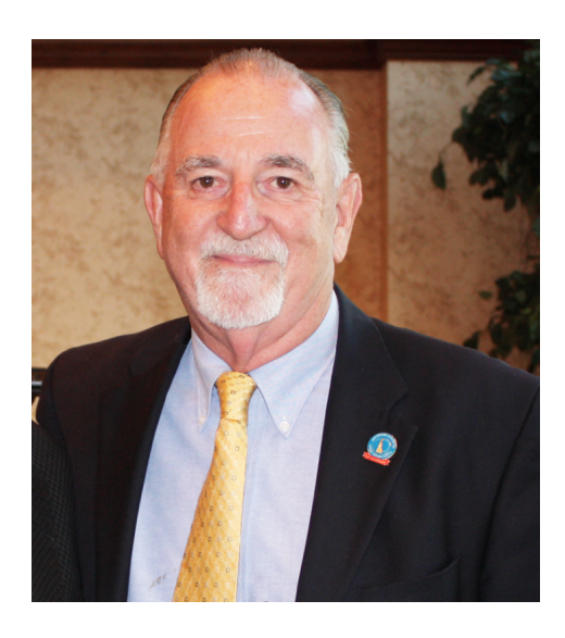
After 20 years of excellent service to the Town of Bethany Beach - very