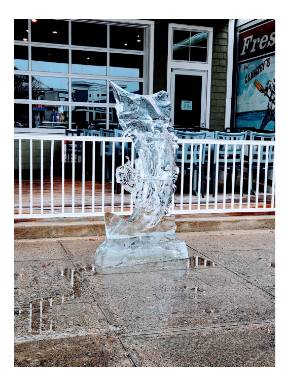
Fire & Ice Weekend: Much Warmer than Expected