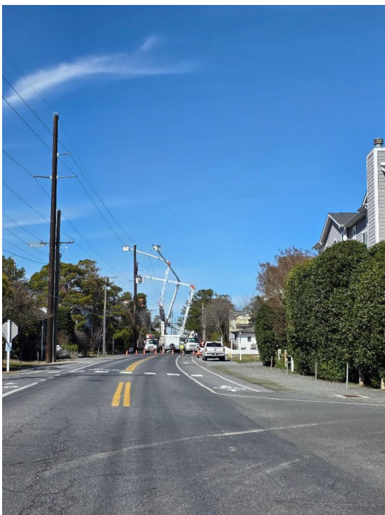
New Utility Poles Being

RASCL: (Delaware) Resilient and Sustainable Communities League