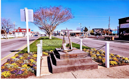
Nice to See the Early Spring Flowers Around Town