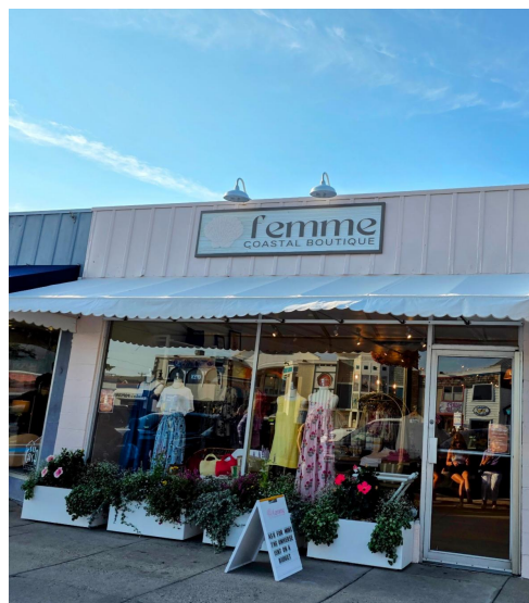
Femme Coastal Boutique on Garfield Parkway