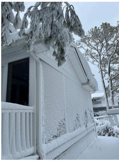
Many Homes & Trees Took a Beating from the Heavy Snow